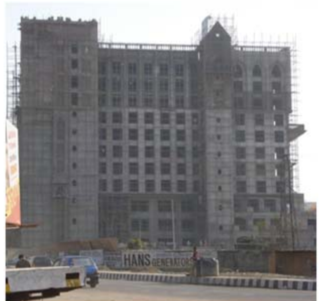
City Court , Office Complex & Mall At Gurgaon , DLF