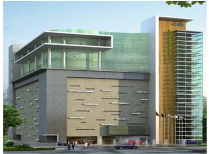
GREENFORT, NOIDA FOR SIFY DATA CENTRE