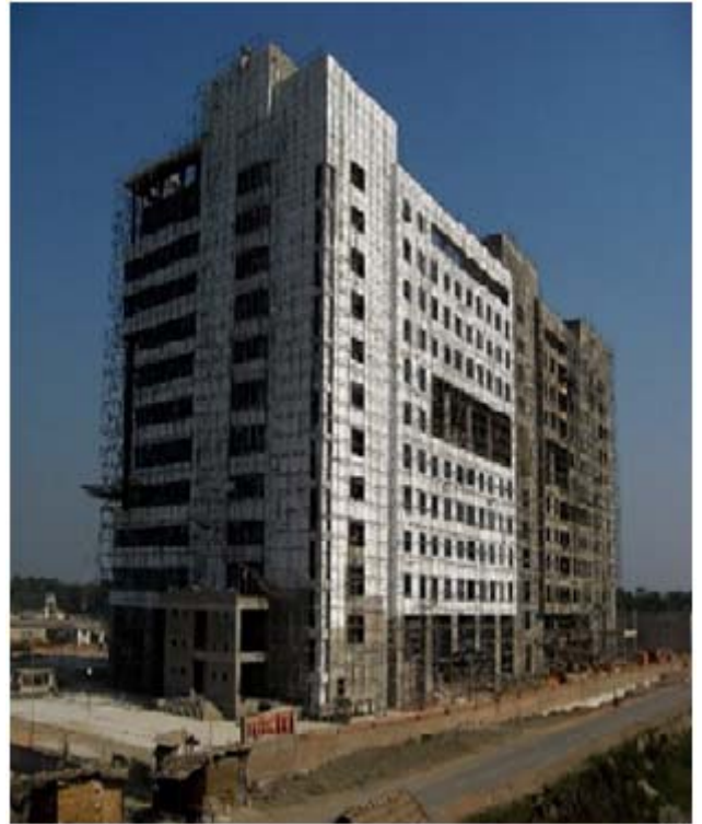
IT PARK KOLKATA, DLF