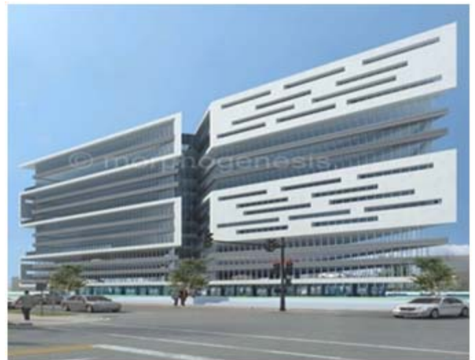
Business Club at Gurgaon(IMPERIA) (Area approximately 4.5 lakh square feet)