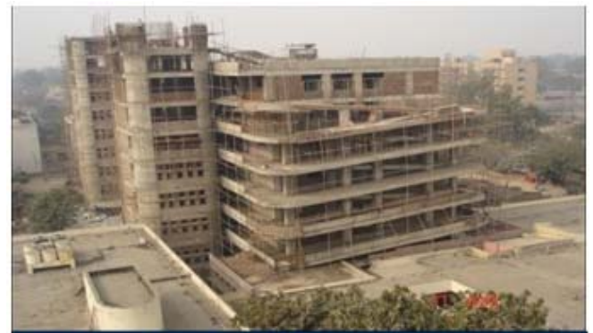
SANJAY GANDHI MEMORIAL HOSPITAL