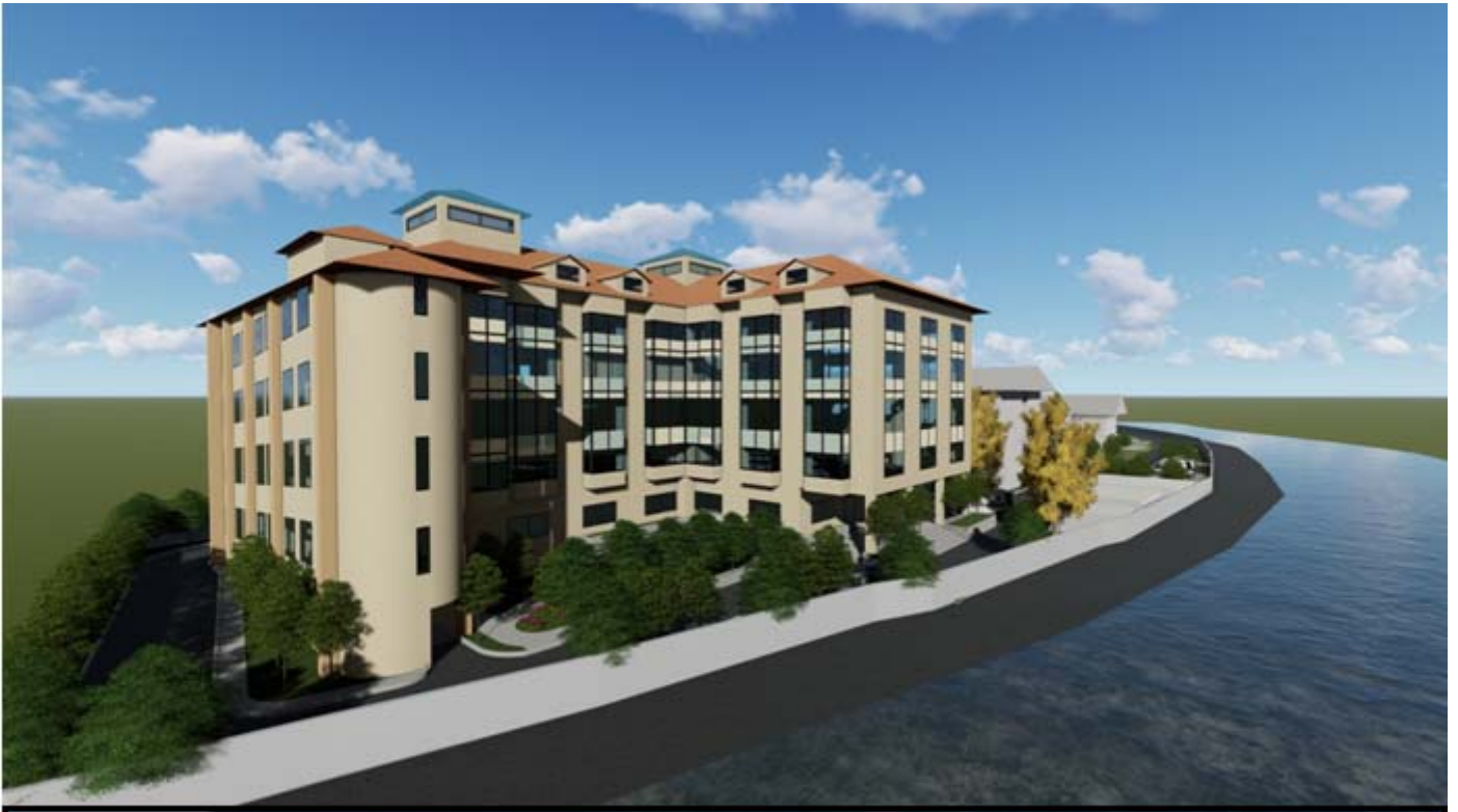
SRINAGAR BONE AND JOINT HOSPITAL, JAMMU AND KASHMIR