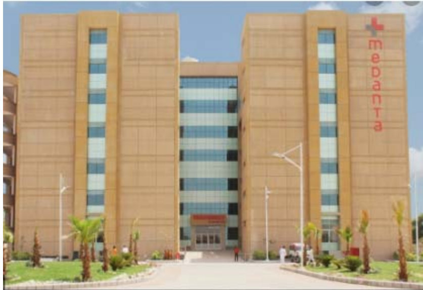
S N SUPER SPECIALTY HOSPITAL