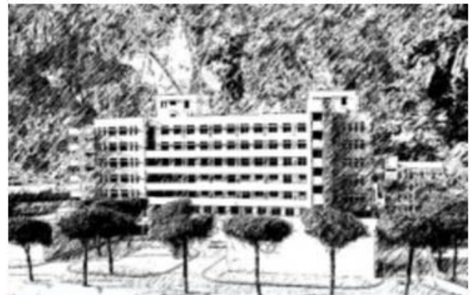
GURU GOBIND SINGH GOVT. HOSPITAL, NEW DELHI