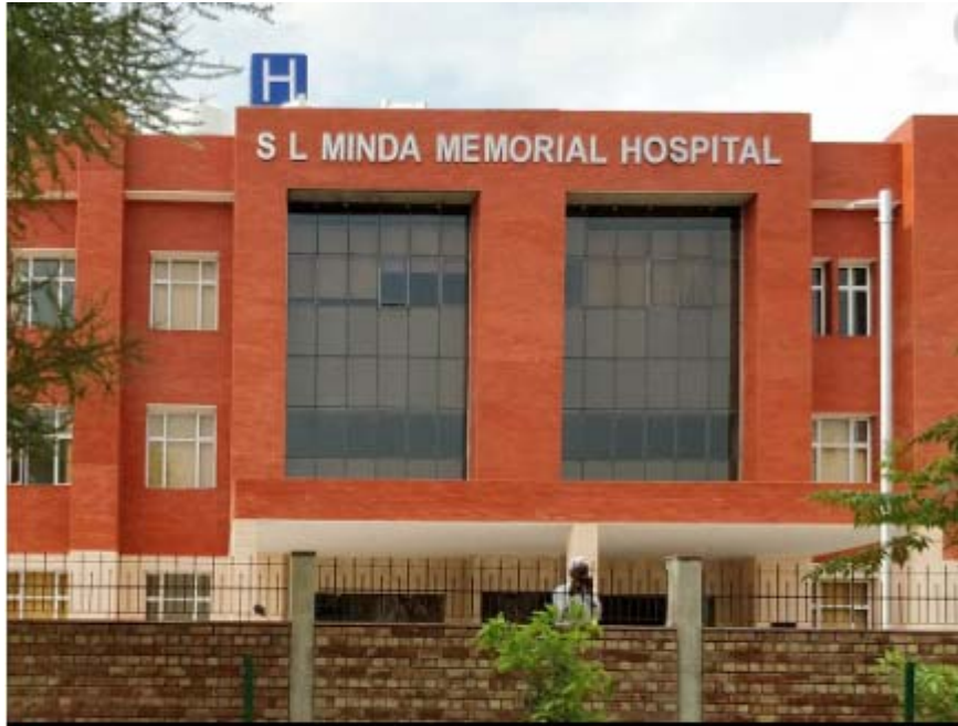
S L MINDA MEMORIAL HOSPITAL