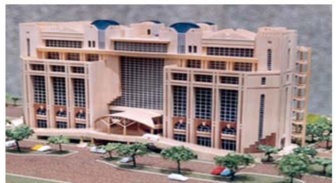
CENTRE FOR DENTAL EDUCATION & RESEARCH, AIIMS, NEW DELHI